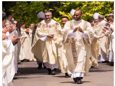
Click the link below for more information - https://melbournecatholic.org/news/three-new-priests-and-a-deacon-ordained-in-melbourne